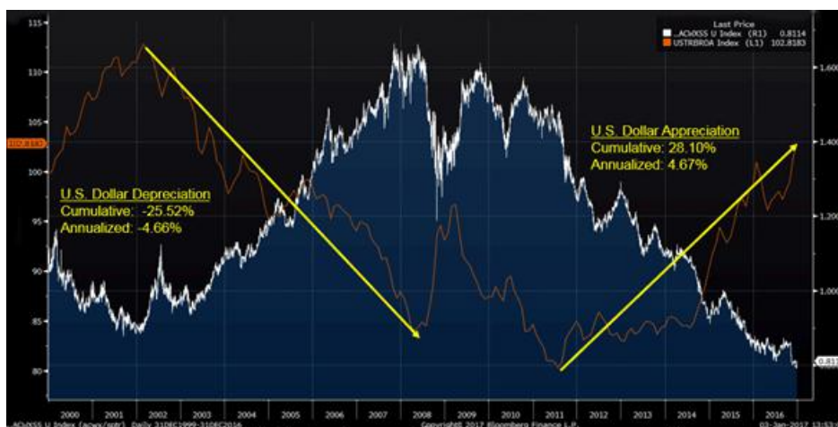
Total Returns of MSCI ACWI ex-U.S. Index Relative to S&P 500 Index (12/31/99–12/31/16)

Past performance is not indicative of future results. You cannot invest directly in an index.