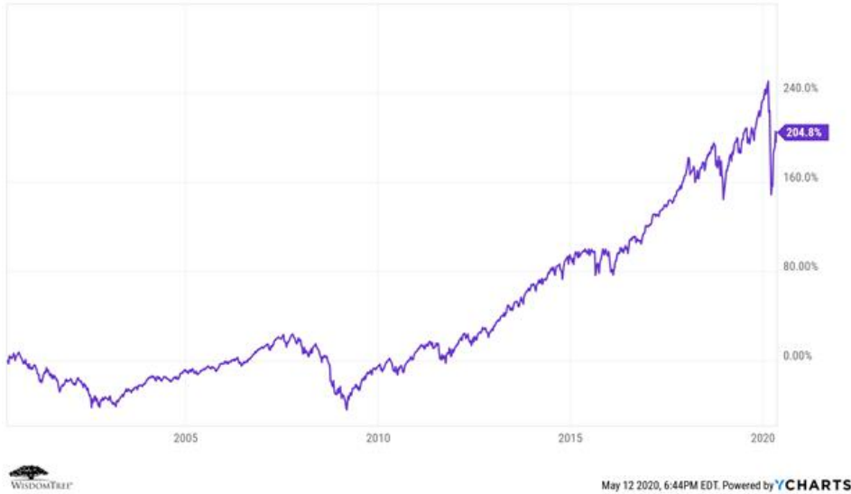
S&amp;P 500 Total Return

Source: YCharts, data through 5/12/20. Past performance is no guarantee of future results. You cannot invest in an index.