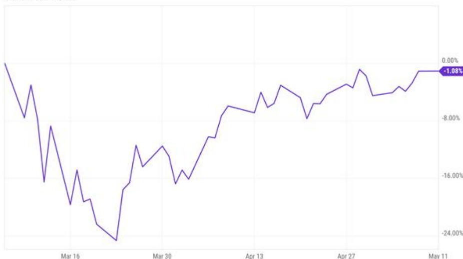
S&P 500 Total Return

First up: From March 6, 2020 until May 12, 2020, a period of a little more than two months, covering a sizeable chunk of the current coronavirus disruption: