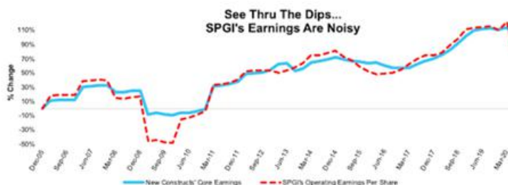
Figure 2: Core vs. SPGI's Operating Earnings for the S&P 500 – % Change: 2005 – Present