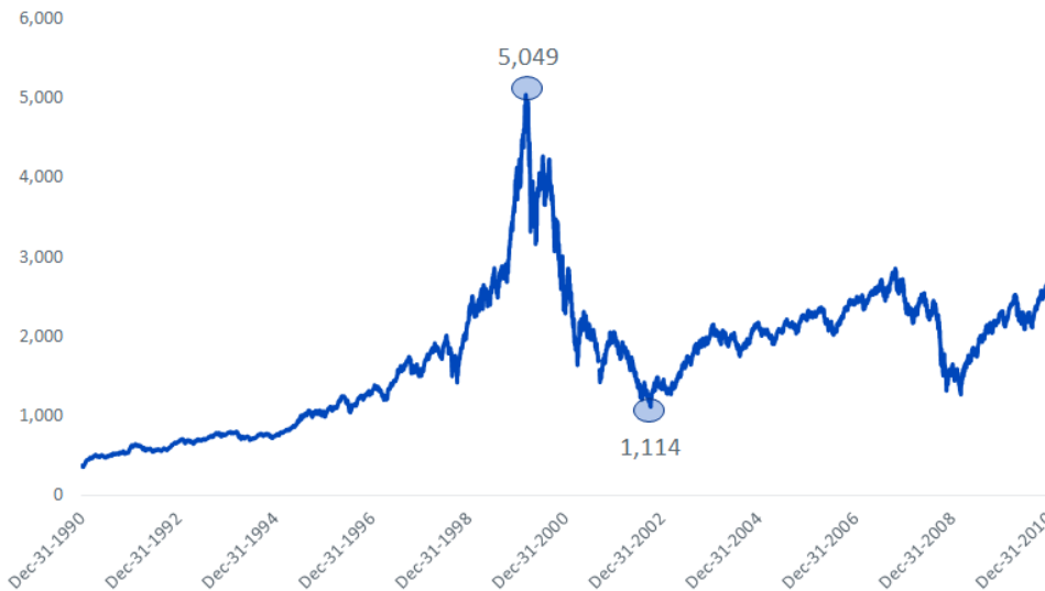
Figure 2: NASDAQ Composite Index

Source: KoyFin, 12/31/1990–12/31/2010. Past performance is not indicative of future results. You cannot invest directly in an index.