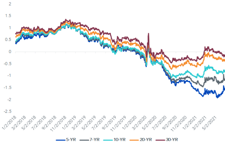
Source: Treasury.gov, data through 6/30/21. Past performance does not guarantee future results.

Bottom line...rates are low and most likely to grind higher as the economy recovers, and spreads are historically tight. Corporate balance sheets generally are in good shape, so coupons should be safe, but there is not a lot of optimism about risk-controlled total return potential.