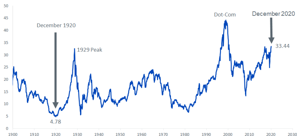
Figure 1: S&P Composite Cyclically Adjusted Price-to-Earnings Ratio (CAPE)