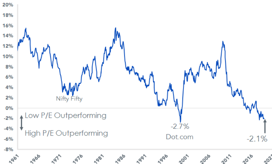
Source: Kenneth French Data Library, for the period 7/31/1951–10/31/2019. Lowest 20% of stocks by P/E minus highest 20% of stocks. Past performance is not indicative of future results. You cannot invest directly in an index.

You know the chorus, but remember, too, the “The Artist Formerly Known as Prince’s” prophecy inside the song: