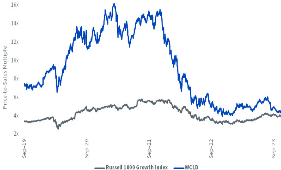
Figure 2a: Valuation Opportunity?

Past performance is not indicative of future results. You cannot directly invest in an index.