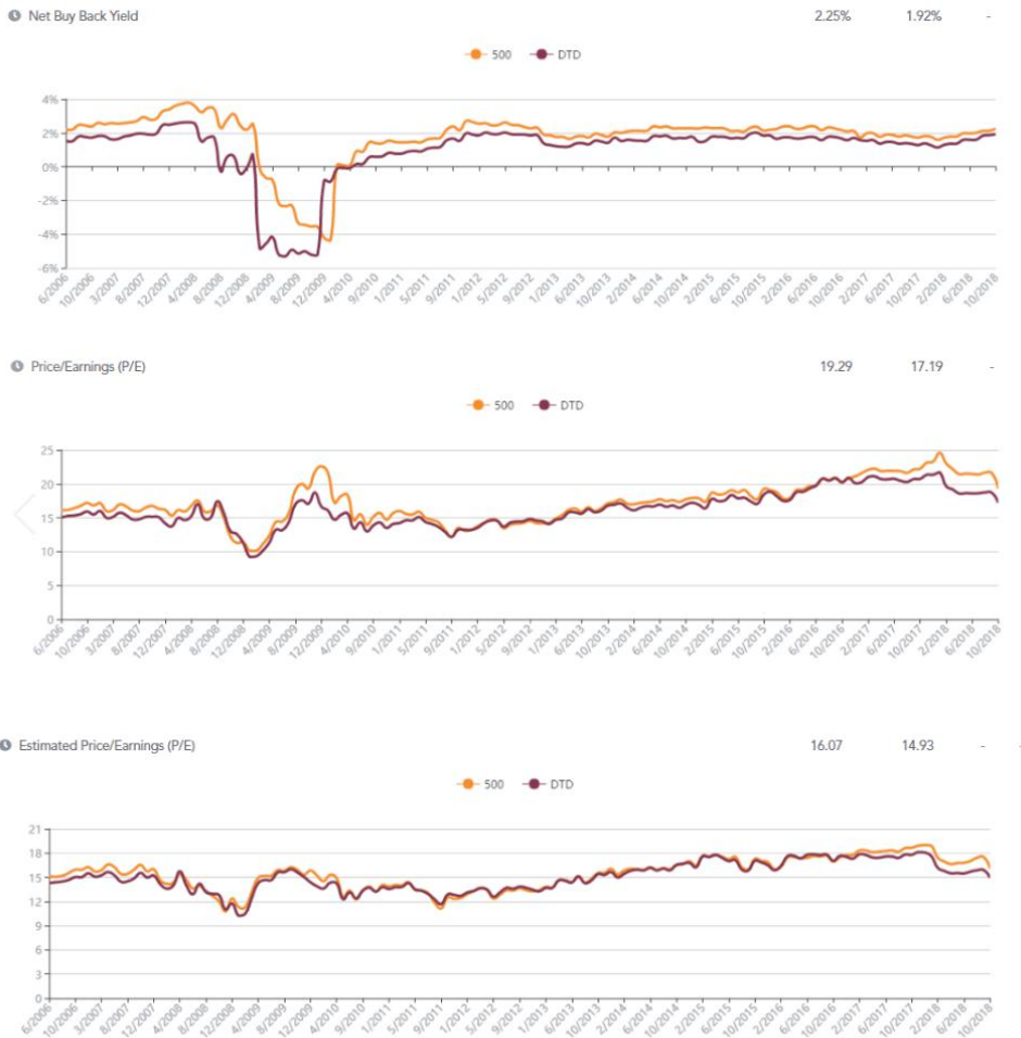
Past performance is not indicative of future results. You cannot invest directly in an index.