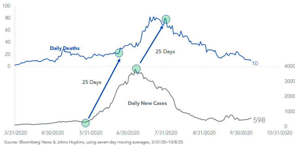
Figure 4: Arizona COVID-19 Daily Deaths and Cases

If both states go red this time around—which is not at all the Street's base case—you have to entertain a thesis where the Republicans retain the Senate and perhaps even take back the House, though the latter is a long shot with 11% probability. Any combination of these outcomes would divert U.S. equity eyes toward Financials and Energy, the two sectors that would benefit most from a swing to the GOP.