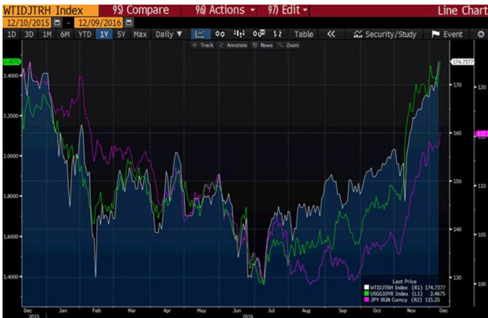
Past performance is not indicative of future results. You cannot invest directly in an index.

Here in the U.S., mid- and small-cap stocks have led the market rally since November 8 and have outperformed most of the major asset classes as shown below. Given the large outperformance of mid- and small-cap companies, is this an area of the market that investors should continue to focus on in 2017? I believe it is, if one can manage for the valuation risk of buying into these asset classes after 2016's large run-up.