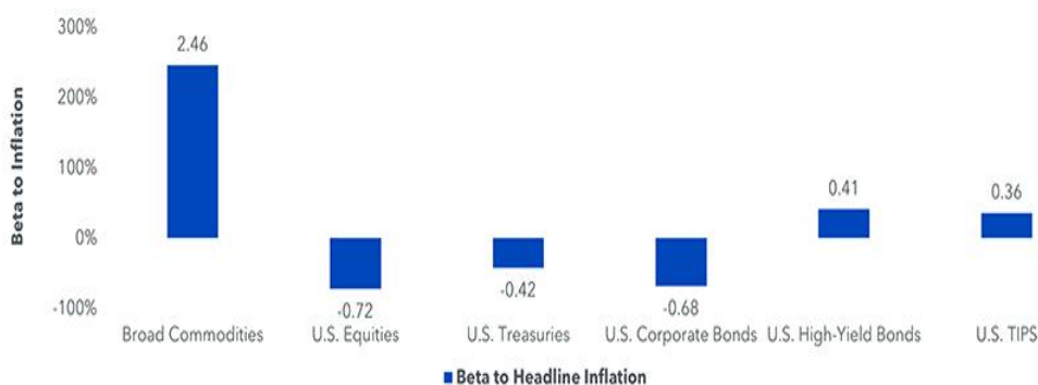
Figure 1: Beta to U.S. Headline Inflation (CPI) of Different Assets

When it comes to assets that can hedge against inflation, commodities have historically stood out as winners. The asset class had the strongest inflation beta of all assets we have analyzed. It beat assets that are supposed to be structurally linked to inflation, such as U.S. Treasury Inflation-Protected Securities (TIPS) .