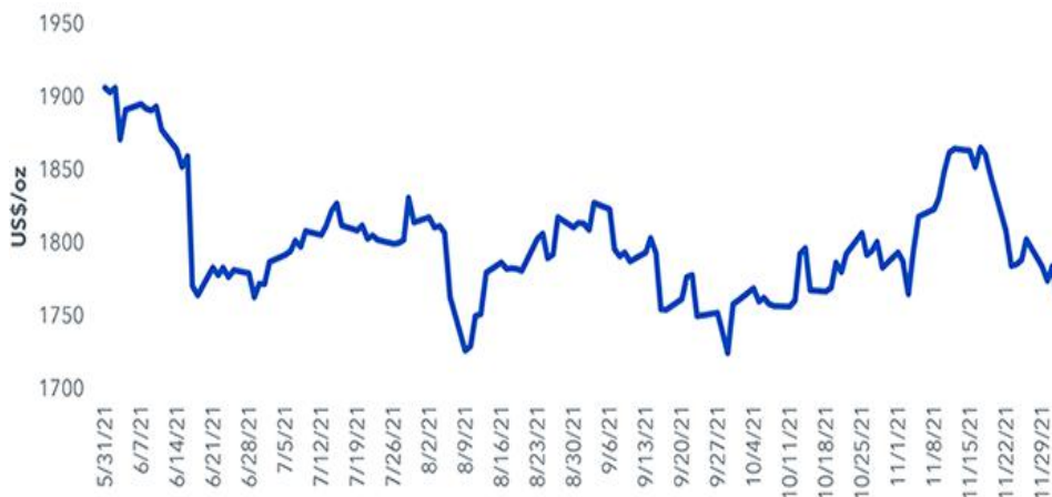
Figure 3: Gold Price Hit a 5-Month High After Inflation Print, but Most Gains Have Dissipated

Sources: WisdomTree, Bloomberg, 5/31/21–12/02/21. Historical performance is not an indication of future performance.