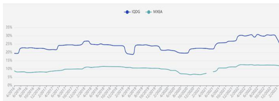
Figure 4a: Return on Equity

In figure 4a, we see how IQDG has consistently exhibited a higher return on equity than MXEA, going back over the full available history horizon to 2016. We'd note that within the methodology of the WisdomTree International Quality Dividend Growth Index, return on equity is focused on, so this result is not wholly unexpected.