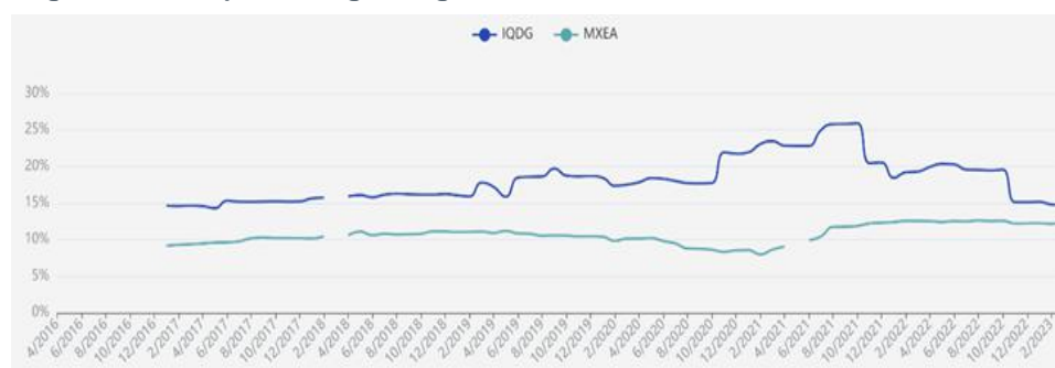
Figure 4c: Operating Margin

Figure 4c is different in that we are now looking at a metric that is not focused on directly within the methodology of the WisdomTree International Quality Dividend Growth Index: operating margin . We see that IQDG did exhibit a higher operating margin across the full range of available data history relative to MXEA. In a more uncertain environment, this could signal potential strength and greater capability to withstand difficulties, should they occur.