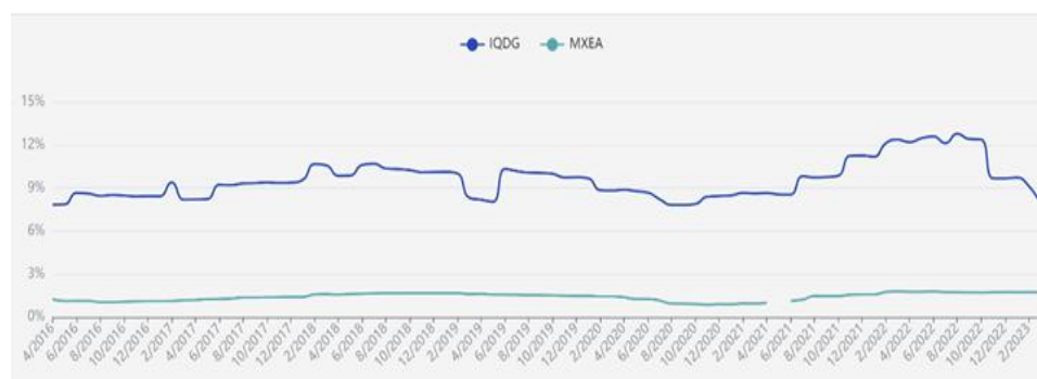
Figure 4b: Return on Assets