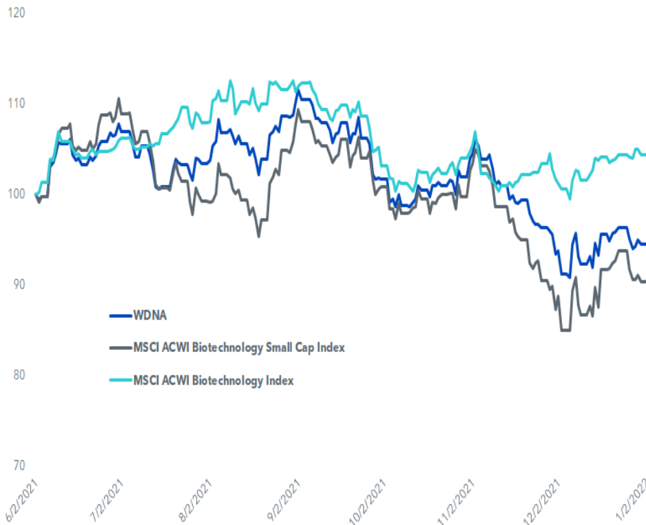
Sources: WisdomTree, FactSet, Bloomberg, for the period 6/2/21-1/4/22 (since WDNA inception). Performance at NAV.