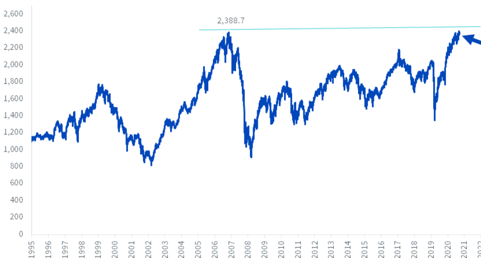
Figure 1: U.S. Average Weekly Earnings of All Employees, Total Private ($)