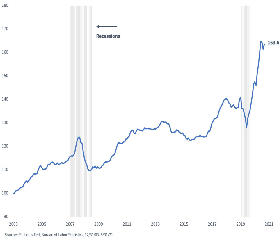
Figure 4: U.S. Producer Price Index: General Freight Trucking, Long-Distance Truckload

The combination of rising energy, transportation and labor costs—not to mention supply chain frustrations—poses an obstacle to firms that have questionable profitability. Levering up thin profit margins to present a robust return on equity (ROE) can work just