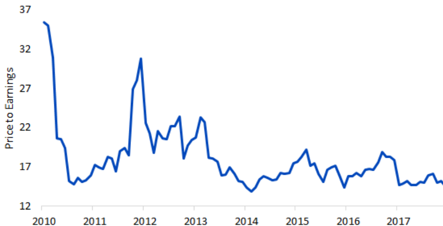
Data from 3/31/2010 – 2/28/2018. Past performance is not indicative of future results. You cannot invest directly in an Index.